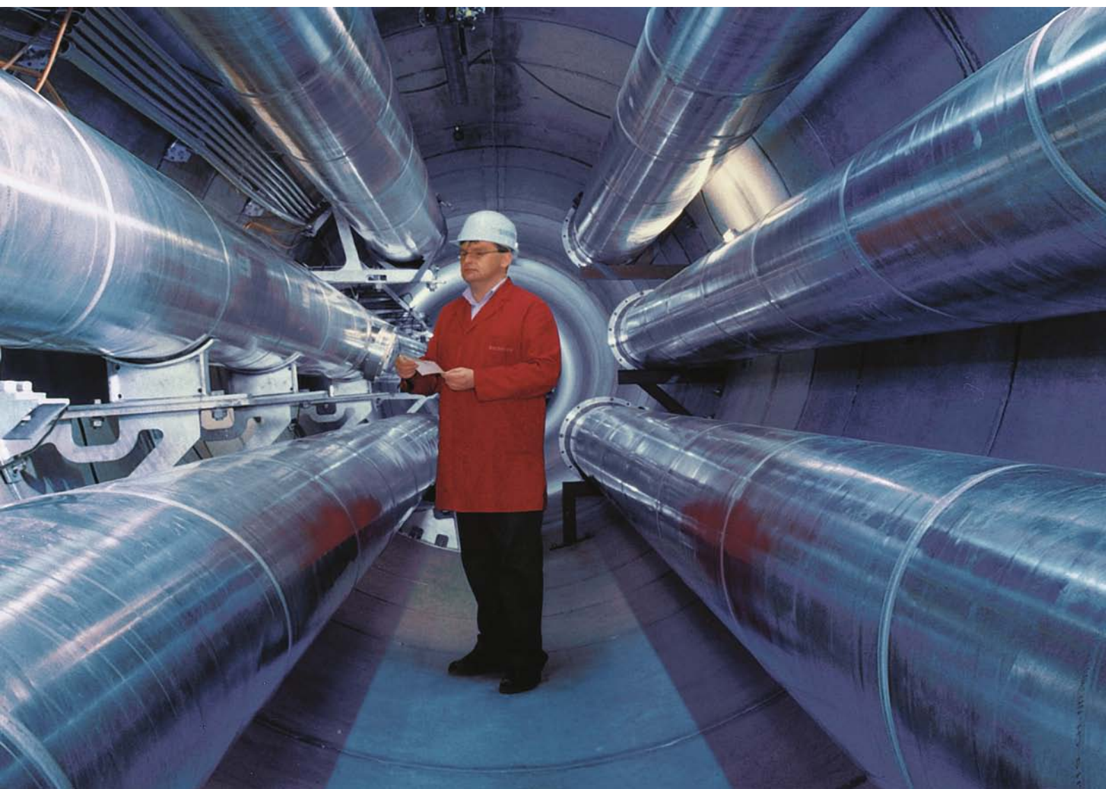
Spiral-welded aluminium pipes \Delta