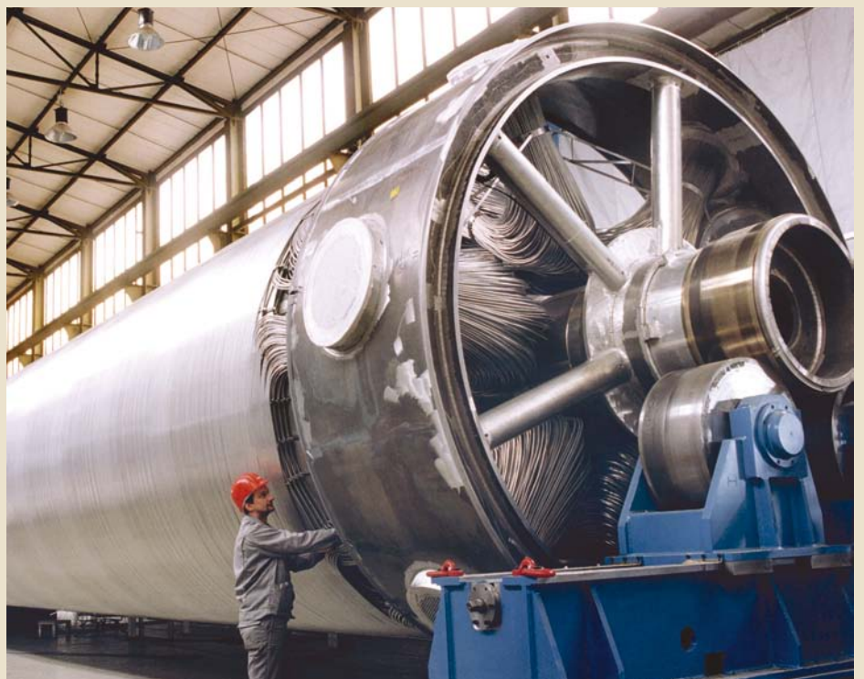
Tube bundle fabrication

Coil-wound heat exchangers are compact and reliable with a broad temperature and pressure range and suitable for single phase as well as two phase streams. Multiple streams can be accommodated in one exchanger. They are known for their robustness in particular during start-up and shut-down or plant trip conditions.