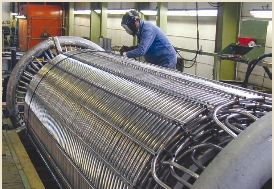
Fabrication of water-bath vaporizer

These kind of vaporizers are used to vaporize liquefied gases such as oxygen, nitrogen, argon, ethylene, propylene and natural gas. The Linde water-bath vaporizer consists of a water vessel in which a coiled tube bundle is submerged. The water is heated by direct steam injection or hot water circulation.