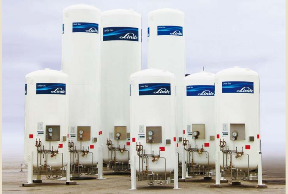
Various sizes of storage tanks

Industrial gases such as oxygen, nitrogen and argon are delivered to customers in liquid form at cryogenic temperatures and are then stored by the customers in tanks before future use. The vacuum-insulated double wall tanks consist of two concentric vessels, an austenitic steel inner tank and an outer jacket in carbon steel with an anti-corrosion primer and a special environmentally friendly top coat.