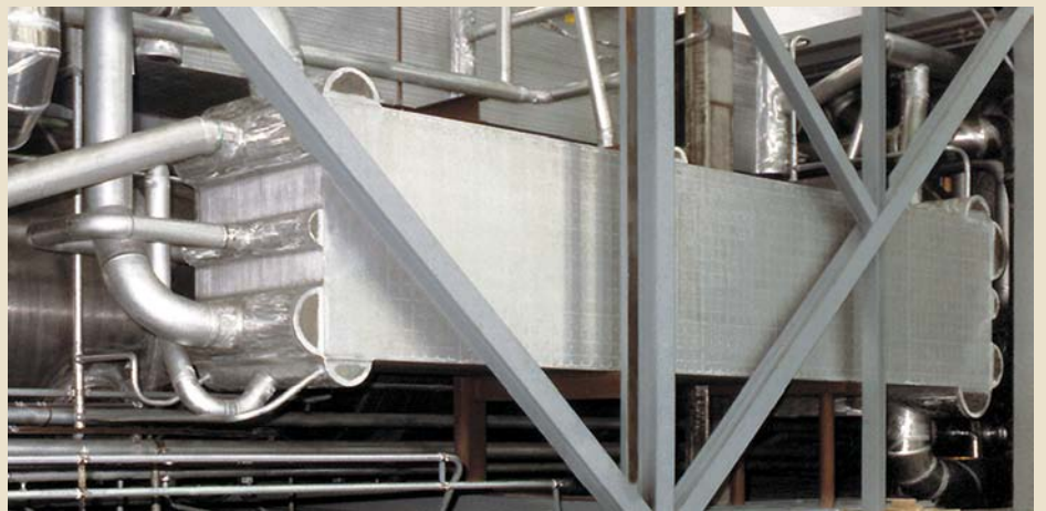
Mounted cold box

An economic alternative to separate installation on site is the assembly of various cryogenic plant components into a steel containment (cold box). Interconnecting piping, vessels, valves and instrumentation are included in this packaged unit to form, after filling with insulation material (perlite), a ready-to-operate unit.