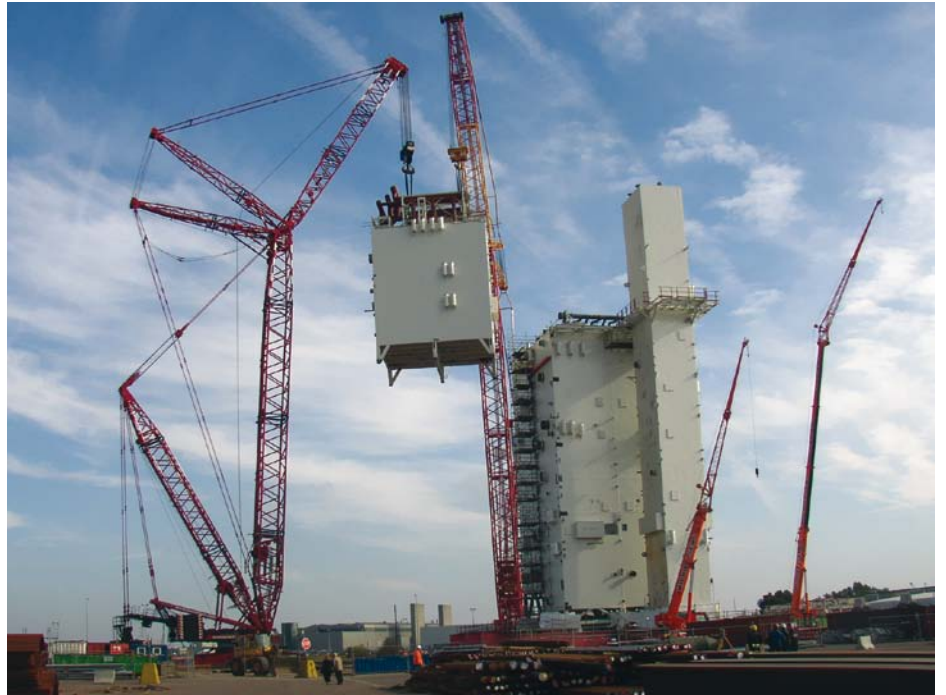
Schalchen plant, approx. 90 km east of Munich, Germany

For very large units satellite workshops are available at the coast (e.g. Bremen/Germany and Antwerp/Belgium).