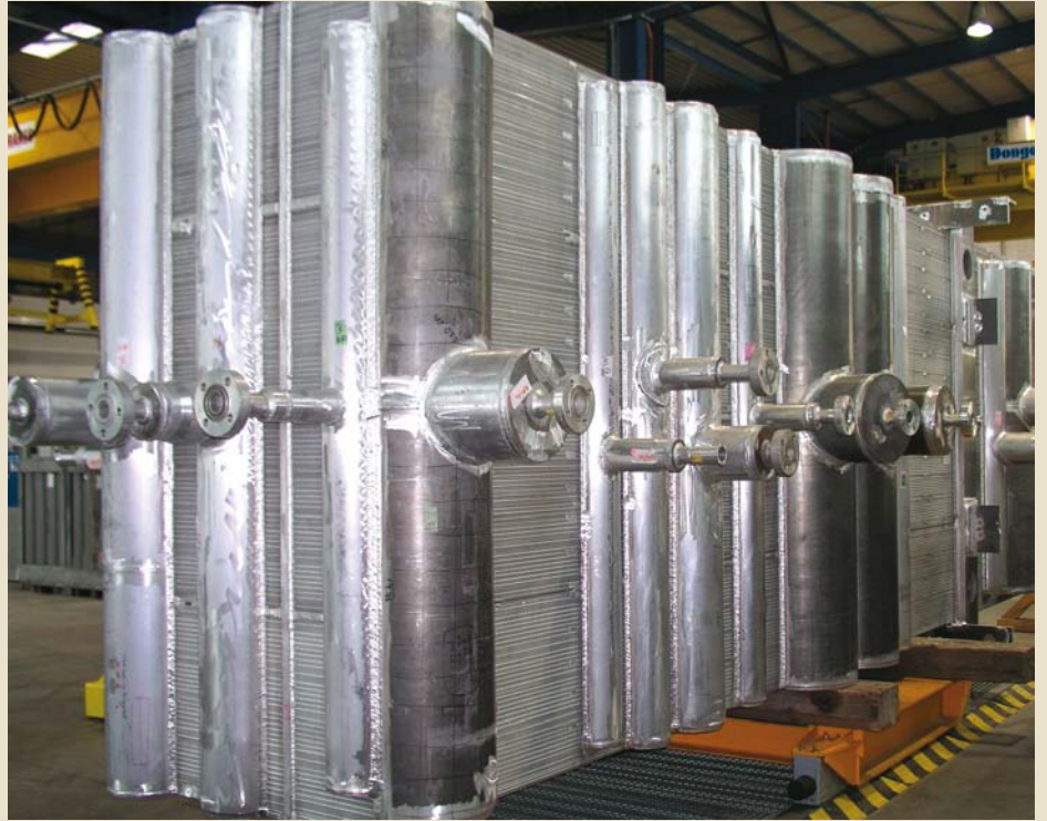
Plate-fin heat exchanger in the production hall

These units are key components in many process plants. Each aluminium plate-fin heat exchanger is specially designed for the required thermal and hydraulic performance thus providing a tailor made and very economic process equipment.